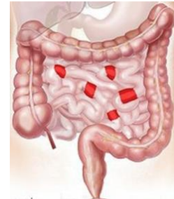
Proximal Small Bowel